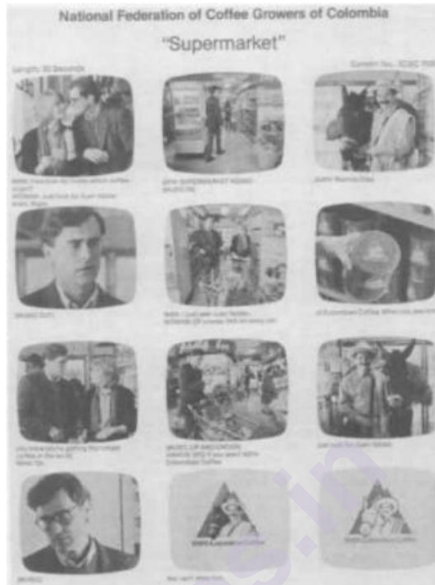
Fig: 1

With reference to the above figure Juan Valdez (the owner of the Juan Valdez Café) as a social icon. The meaning of social symbols is perhaps most constant within the culture in which they were created. When symbols crossover cultures and eras while maintaining their basic meaning, they are called archetypes. Many social symbols, in fact, are based on underlying, long-lasting archetypes, which are subsequently given more distinctive interpretations by each society.