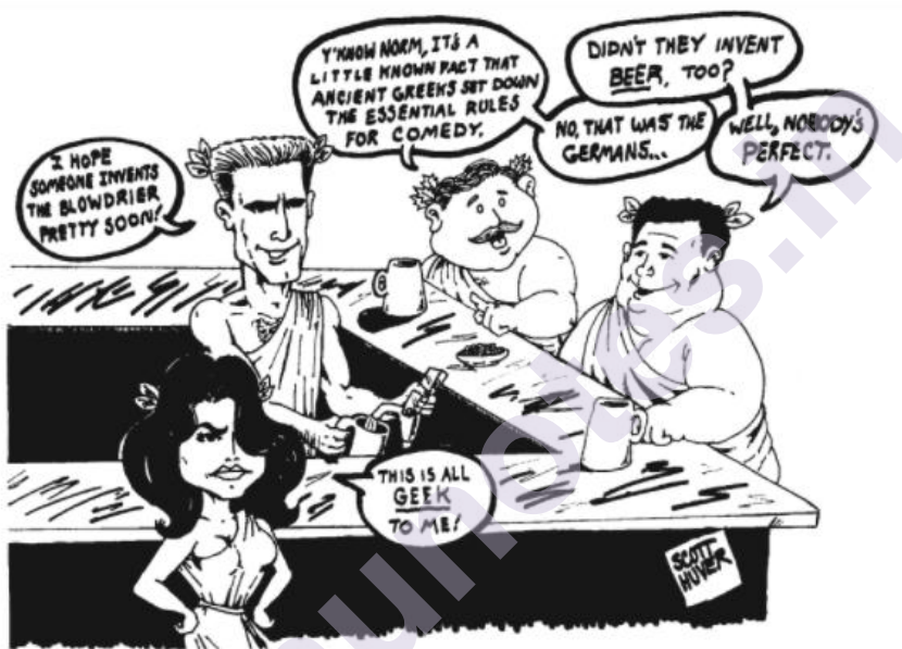
Fig: 2 (Cheers embodiments of ancient Greek archetypes.

Dr. Frasier Crane, the blabbering and pretentious psychotherapist, was an agroikos "killjoy refuser of festivity" at the start of his career. However, as his character expanded, his inability to recognize his own lack of self-awareness became the topic of longer humorous plot lines. Lilith, a fellow psychologist (and later spouse), became a regular attendee. Frasier's prior agroikos role was taken over by Lilith, who gave it both 'grumpy' and 'serious' qualities.