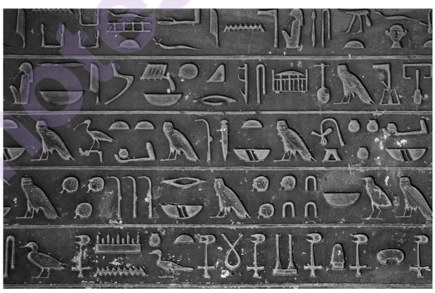
A photograph of an ancient Egyptian language.