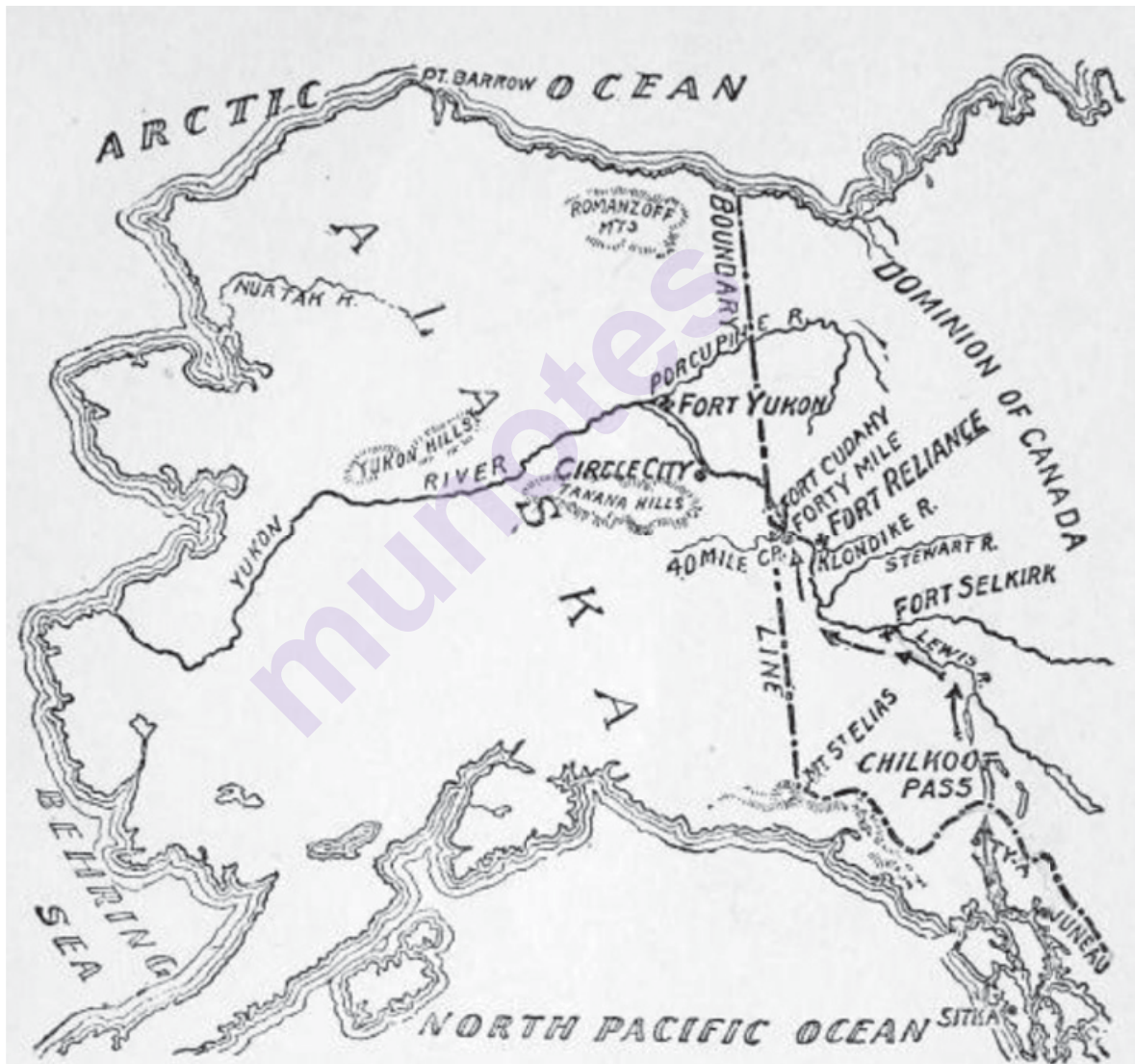
Map of the Yukon Gold Diggings

30 “But the summit of Chilcoot Pass—that’s the place that puts the yellow fever into many a man’s heart. Some took one look at it, sold their outfits for what they would bring and turned back. This pass is over the ridge which skirts the coast. It is only about 1,200 feet from base to tip, but it is almost straight up and down—a sheer steep of snow and ice. There is a blizzard blowing there most of the time, and when it is at its height, no man 35 may cross. For days at a time the summit is impassable. An enterprising man named Burns has rigged a windlass 2 and cable there, and with this he hoists up some freight at a cent a pound.”