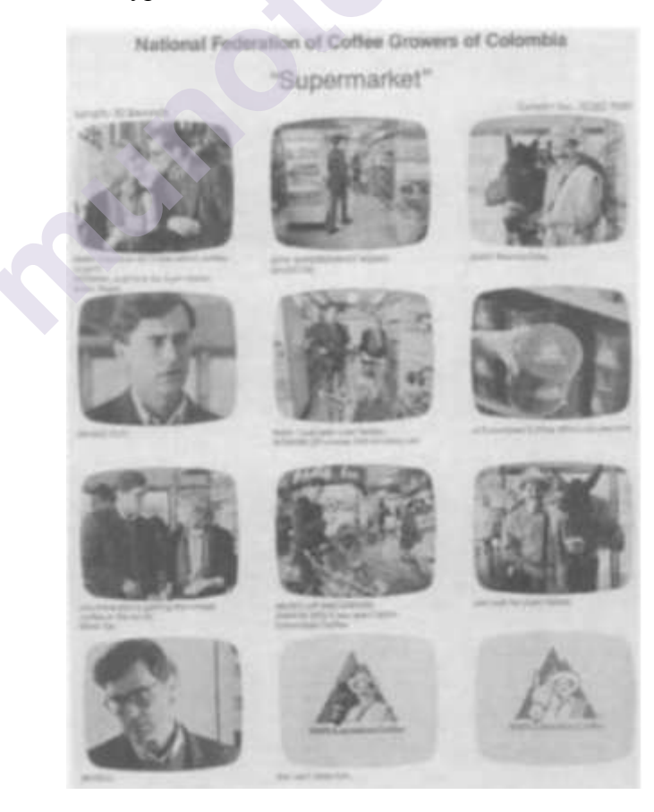
Fig: 1

Symbols, whether verbal or graphical, can also be classified as personal, societal, or archetypal.