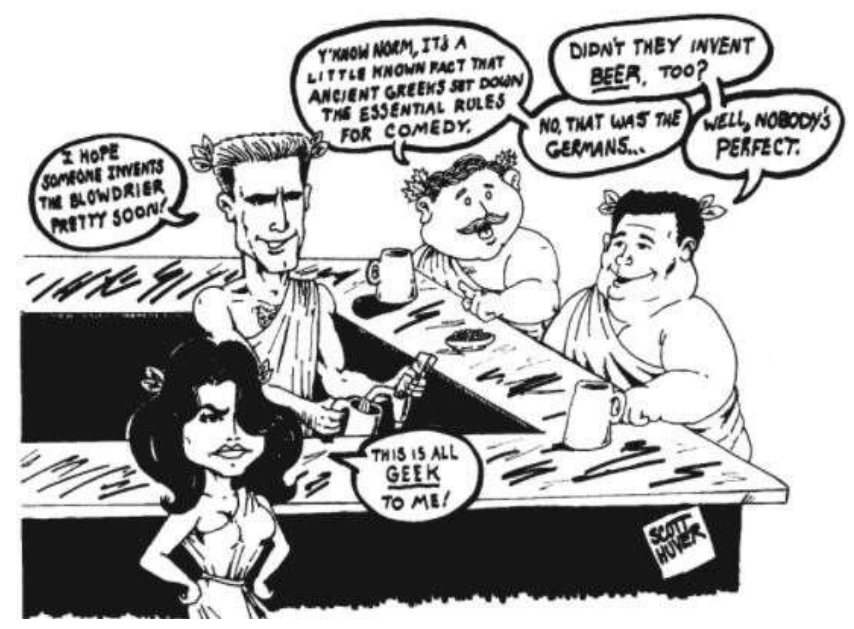
Fig: 2 (Cheers embodiments of ancient Greek archetypes. (Illustration by Scott Huver)